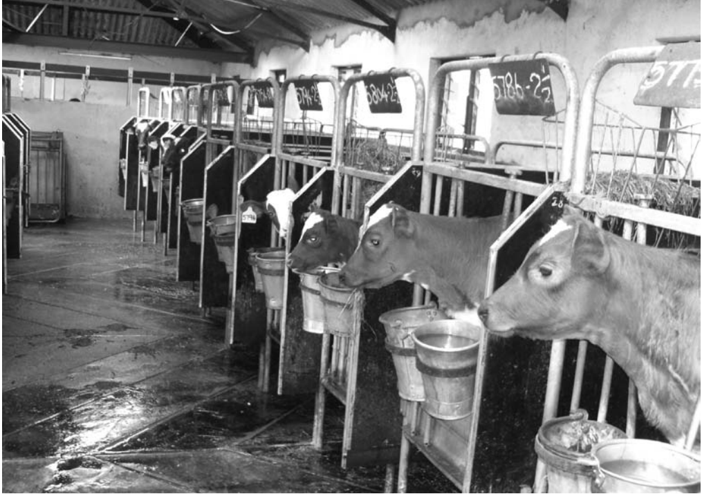
A well-managed calf-rearing shed (Sri Lanka).

There is no single best way to milk rear calves. All sorts of combinations of feeding, housing and husbandry can be successful in the right hands and on the right farm. Successful calf rearing is a specialist job requiring suitable facilities. It also requires a genuine concern for the welfare of young calves and quick responses to early symptoms of disease. If farmers are unable to commit the time and resources to rearing their own replacement heifers, they should seriously consider paying someone who is better placed to do a good job. The establishment of cow colonies in many Asian dairy industries, and the sharing of resources of farmers supplying a single dairy cooperative, provide the opportunity for a specialist calf and heifer rearer to milk rear and grow out the replacement stock for many farmers.