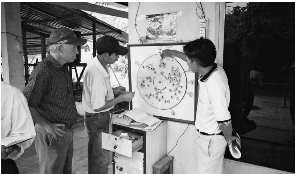
A cow breeding wheel to monitor when cows are successfully bred (Vietnam).