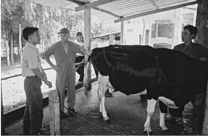
Routine pregnancy diagnosis is an integral part of good reproductive management (Vietnam).

measures describe the rate at which cows get pregnant when mated and the number that remain non-pregnant following mating.