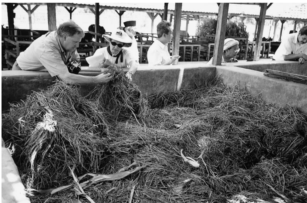
Many dairy farmers in South-East Asia have constructed cement boxes to make urea-treated rice straw, which is supposedly a good forage source for milking cows.

Alkali treatment improved digestibility of the dry matter and of energy and Metabolisable Energy content, but reduced dry matter intake. Even when alkali treated and supplemented with 30% Leucaena , the Metabolisable Energy content only improved from 5.4 (untreated rice straw) to 7.2 MJ/kg DM (treated rice straw plus Leucaena ), still lower than that of Napier grass (8.9 MJ/kg DM). The Leucaena supplement improved the nitrogen balance in the cattle above that of Napier grass (20 v 14 g/d).