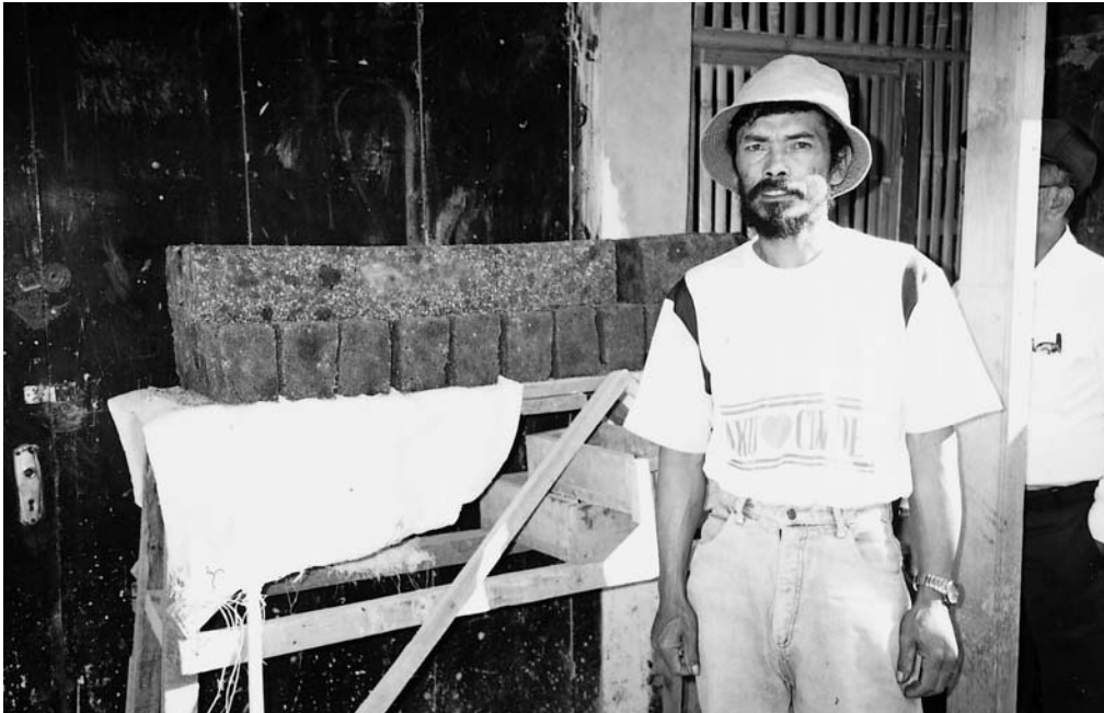
The proud Indonesian dairy farmer who designed the press (shown in the photo on p. 111) with some of his feed blocks

Once adequate quality forage is available to provide the energy required, milk responses to manipulating the proportion of protein as undegradable dietary protein or even providing additional nitrogen in the form of urea, are more likely to be economical and sustainable. As with chemical treatment of rice straw, adoption of nutrient feed blocks by small holder farmers has been slow, presumably because of the extra effort required to present the feed to the cows. Farmers are driven by profit margins, and even though labour costs are often not included in any profit calculations, extra effort must lead to considerably higher milk sales or lower feed costs or else it is 'not worth it'.