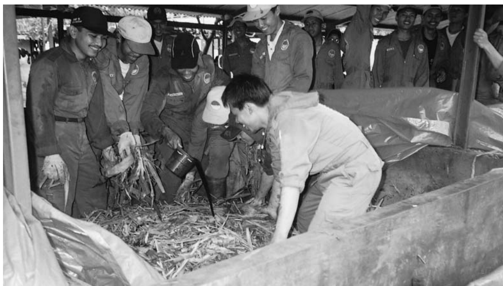
Such cement boxes should be used to make silage, generally a better quality forage than urea-treated rice straw.

MJ/kg DM of ME, while the untreated rice straw contained 6.9% CP and 7.0 MJ/kg DM of ME.