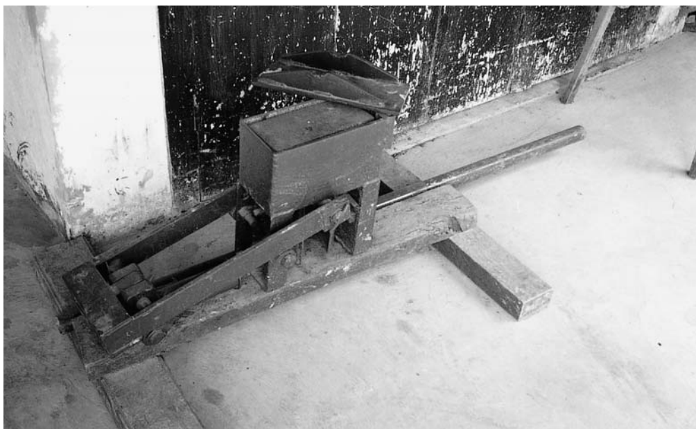
A press for making feed blocks incorporating molasses, protein meal and minerals (West Java Indonesia).

By incorporating molasses and urea into a solid block, additional nutrients such as specific minerals or veterinary drugs such as anthelmintics can be easily included in the blend. There is considerable interest in developing high quality feed blocks incorporating mixtures of protein sources, such as rice bran, cottonseed meal and fish meal, which may be useful in higher yielding stock.