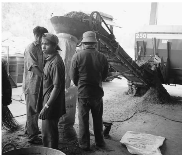
The Nong Yai feed centre managed by the Banbueng dairy cooperative in southern Thailand. This centre stores maize silage in tower and pit silos and prepares total mixed rations for delivery to cooperative members.